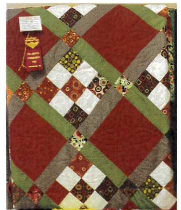
To the right: Retrofusion Quilt