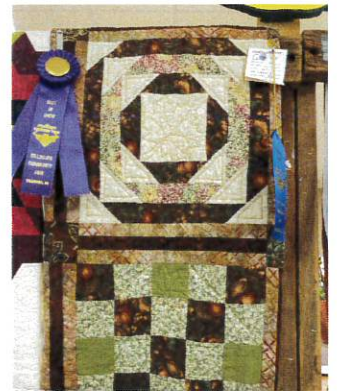
Above: Best in Show!

The Maple Shade Quilters will also be selling fiber merchandise and displaying quilts for your enjoyment!