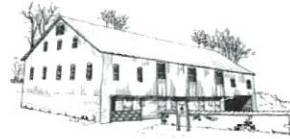
Maple Shade Barn