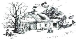
Eichelberger Distillery AT DILL'S TAVERN