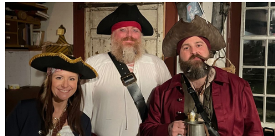
First Friday at Dills Tavern April 5th; from 7:00 pm - 10:00 pm with Stone House Breakdown

Arrr, shiver me timbers! Everyone had so much fun at last year's Pirate Night that we couldn't let our First Friday season end without hosting another one. Come dressed as your favorite pirate and join the fun.