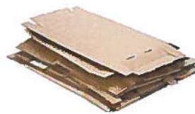
CARDBOARD Dry & Flattened No Food Contact