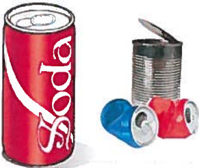
CANS Aluminum & Steel