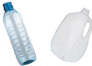
PLASTIC Bottles & Jugs 1, 2 & 5