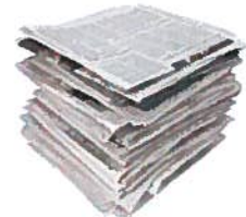
NEWSPAPER Clean & Dry No Food Contact