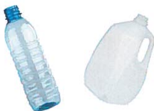
PLASTIC Bottles & Jugs 1, 2 & 5