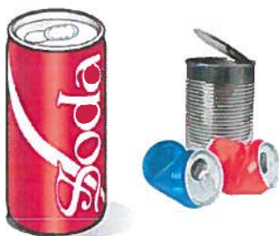
CANS Aluminum & Steel