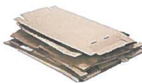
CARDBOARD Dry & Flattened No Food Contact