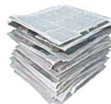
NEWSPAPER Clean & Dry No Food Contact