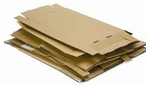
CARDBOARD Dry & Flattened No Food Contact