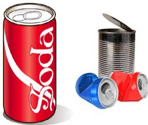
CANS Aluminum & Steel