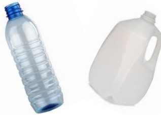
PLASTIC Bottles & Jugs 1, 2 & 5