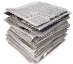
NEWSPAPER Clean & Dry No Food Contact