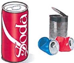
CANS Aluminum & Steel