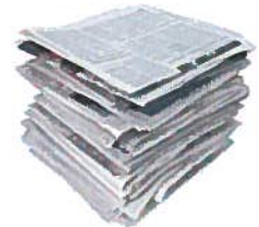
NEWSPAPER Clean & Dry No Food Contact