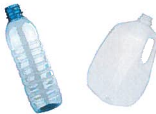
PLASTIC Bottles & Jugs 1, 2 & 5